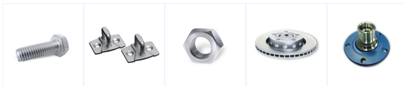
Non metrical threaded parts