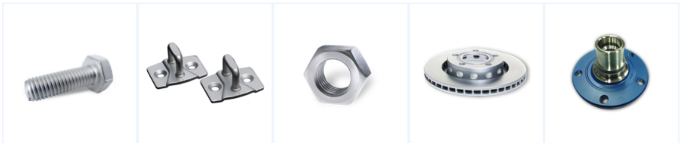
Non metrical threaded parts